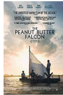
The Peanut Butter Falcon February 4

Excitement is high at Downton Abbey when the Crawley family learns that King George V and Queen Mary are coming to visit. But trouble soon arises when Mrs. Patmore, Daisy and the rest of the servants learn that the king and queen travel with their own chefs and attendants.