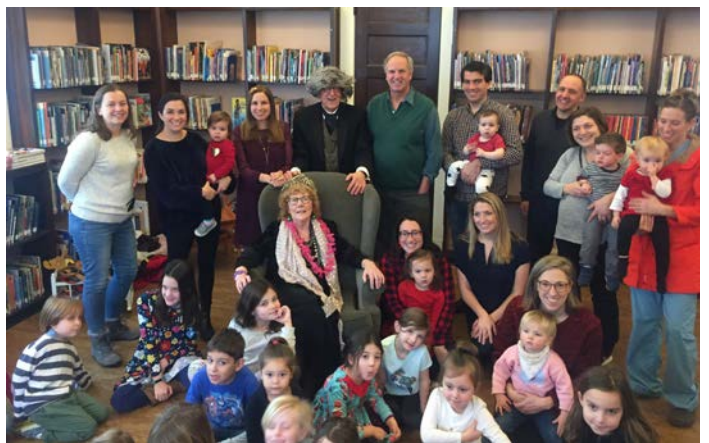
Introduction to "The Nutcracker" 1990-2019