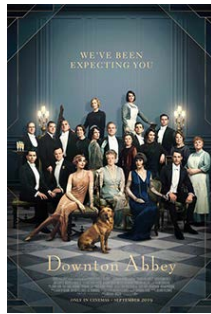
Downton Abbey January 21

Javed is a Pakistani teenager experiencing racial and economic turmoil while living in England in 1987. When a classmate introduces him to Bruce Springsteen's music, he sees parallels between the singer's powerful lyrics and his own working-class environment.