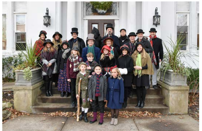
Scrooge Stroll, December 8

A celebration of our U.S. presidents. For 2020 kindergartners and up.